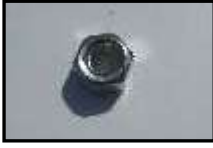
P-28 - 7.5MM - QTY. - 8