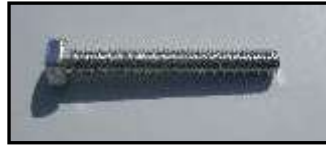
P-28 - 62x7.5MM - QTY. - 8