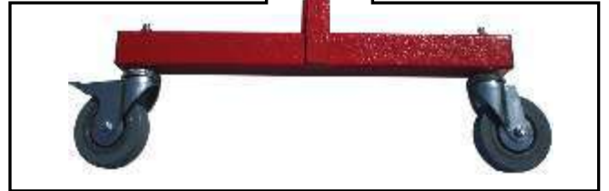
P-9 - 510x200x45x45 MM - QTY. - 4